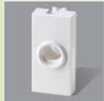
CW462WHI Satellite Cable TV Outlet - 1M

RJ45 CAT6 Computer Jack L - 45mm, B - 22.4 mm, D - 32.3 mm; RJ11 2 Line Telephone Jack with and without shutter L - 45mm, B - 25mm, D - 18.10mm