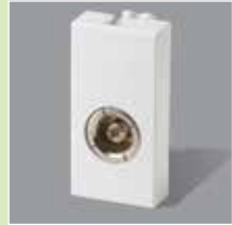
CW451WHI TV Coaxial outlet - 1M

Citric communication range consists of TV coaxial - 1M, Computer jack - 1M and Telephone jack - 1M. The entire range is designed for maximum data and voice transfer efficiency. Features in the range are designed to deliver minimal signal loss, ease of installation and low maintenance.