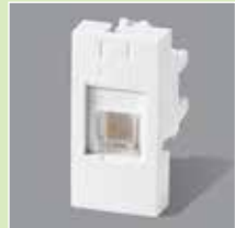
CW493WHI RJ45 CAT6 Computer Jack - 1M