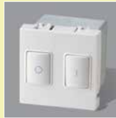
CW217WHI Motor Starter