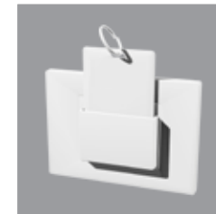
CW527WHI 20A Energy Key Switch with Time Delay