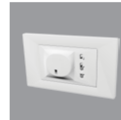
CW529WHI Shaver Socket

Citric hospitality range is smart energy saving specially designed for the hotel industry. It saves energy without compromising the comfort of the guest. Feature packed and with superior aesthetics, Citric range of hospitality products are in complete synergy with the hospitality industry requirements. The range is convenient, safe and efficient.