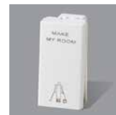
CW415WHI 1 Way Switch MMR - 1M